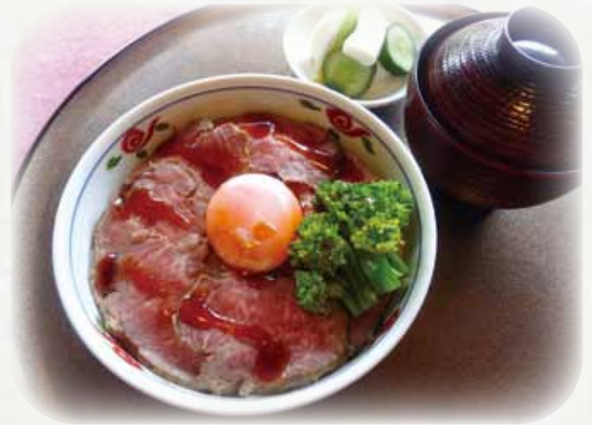
Roast beef don ¥1,620