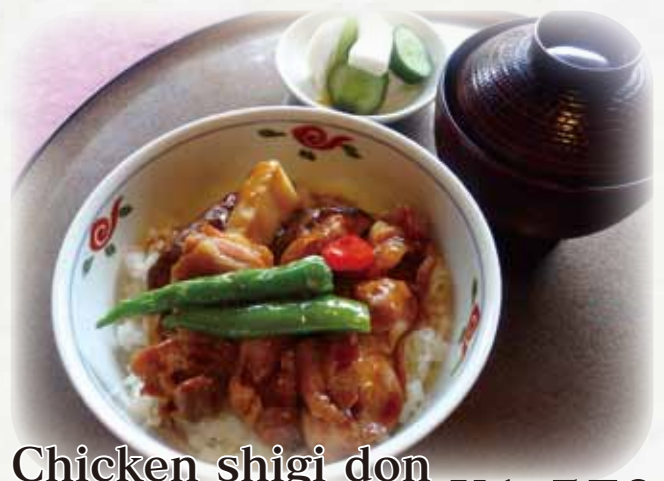
Chicken shigi don ¥1,570 Rice bowl topped withgrilled chicken with sweet and salty sauce