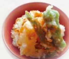
Ten Don Don of tempura