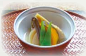
Simmered vegetables ¥440