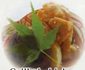
Grilled chicken with sweet and salty sauce