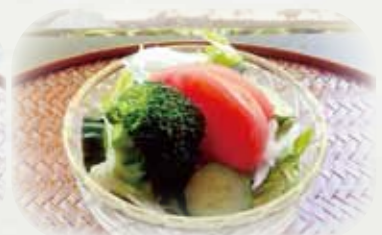
Mini salad ¥350