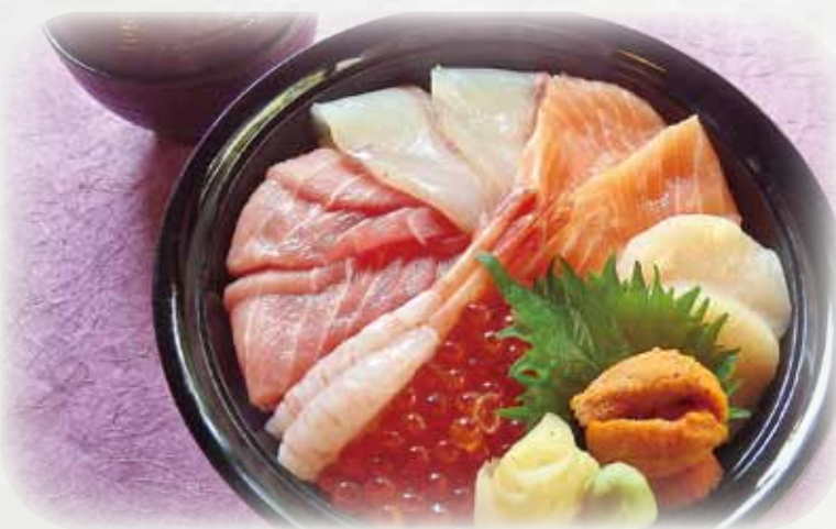
Fresh looking and taste Kaisen Don ¥2,380 and miso soup

Large portion of rice ¥220(including tax) Small portion of rice is also available.