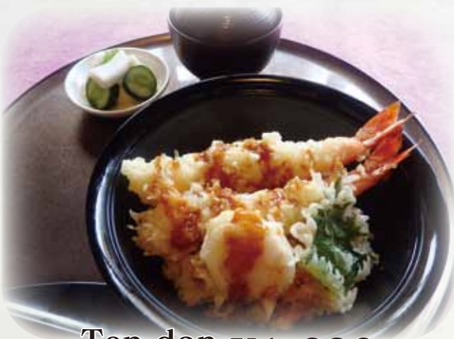
Ten don ¥1,620 Don of tempura

Large portion of rice ¥220(including tax) Small portion of rice is also available.