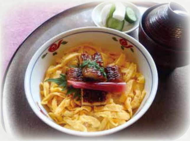
Eel don ¥1,840