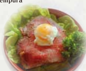
Roast beef Don