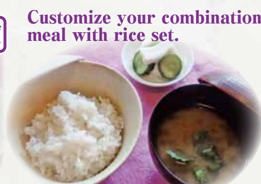
Customize your combination meal with rice set.