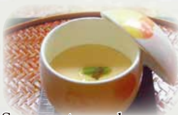
Savory steamed egg custard ¥540 with eel