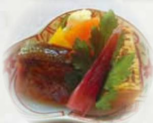
Miso marinated seasonal fish