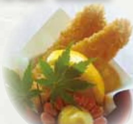
Crispy fried salmon