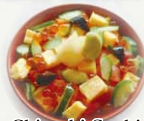
Chirashi Sushi Don of assorted sashimi and other fresh ingredients