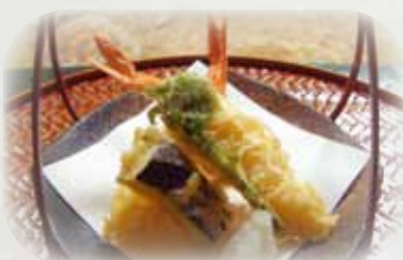
Mini tempura ¥540