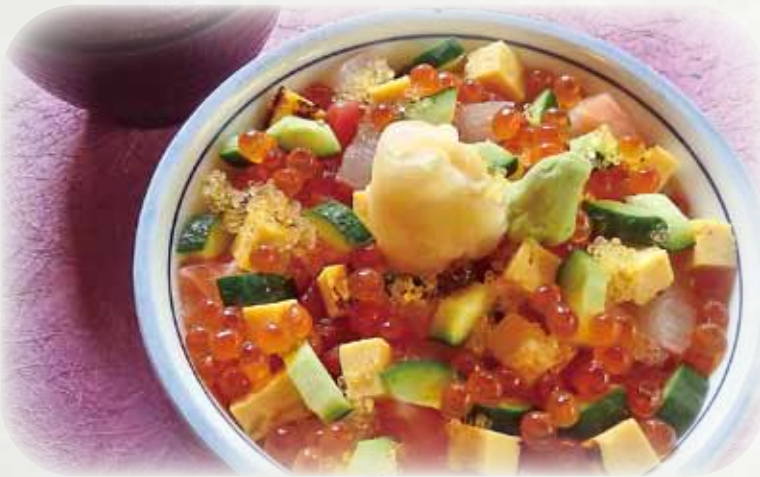
Chirashi Sushi ¥1,620 and miso soup

Don of assorted sashimi and other fresh ingredients