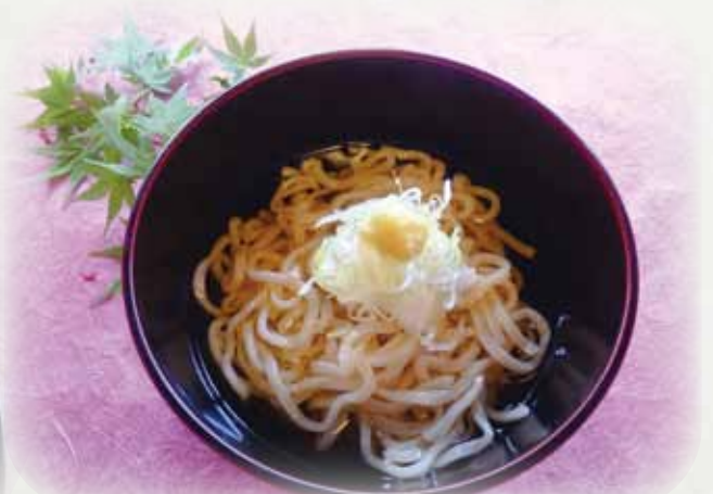
Mini udon noodle ¥440 (warm/cold)